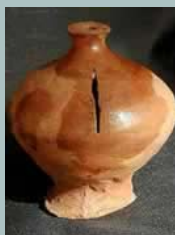
Tudor pig bank

Money also used to be kept in the jars and in England, by the turn of the eighteen century, the jars had acquired the name of "pig banks", from where followed the name "piggy bank." These piggy banks were ceramic and had no hole in the bottom, so the pig had to be broken to get the money out.